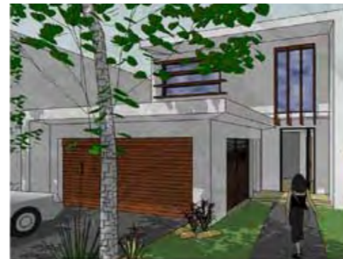
TOP Jankelowitz Residence north west perspective ABOVE Tal Residence north west perspective OPPOSITE TOP Rosen Residence north west perspective OPPOSITE BOTTOM Rosen Residence internal courtyard perspective

With all four plans submitted to Waverley Council in February, DA status was granted mid-year and